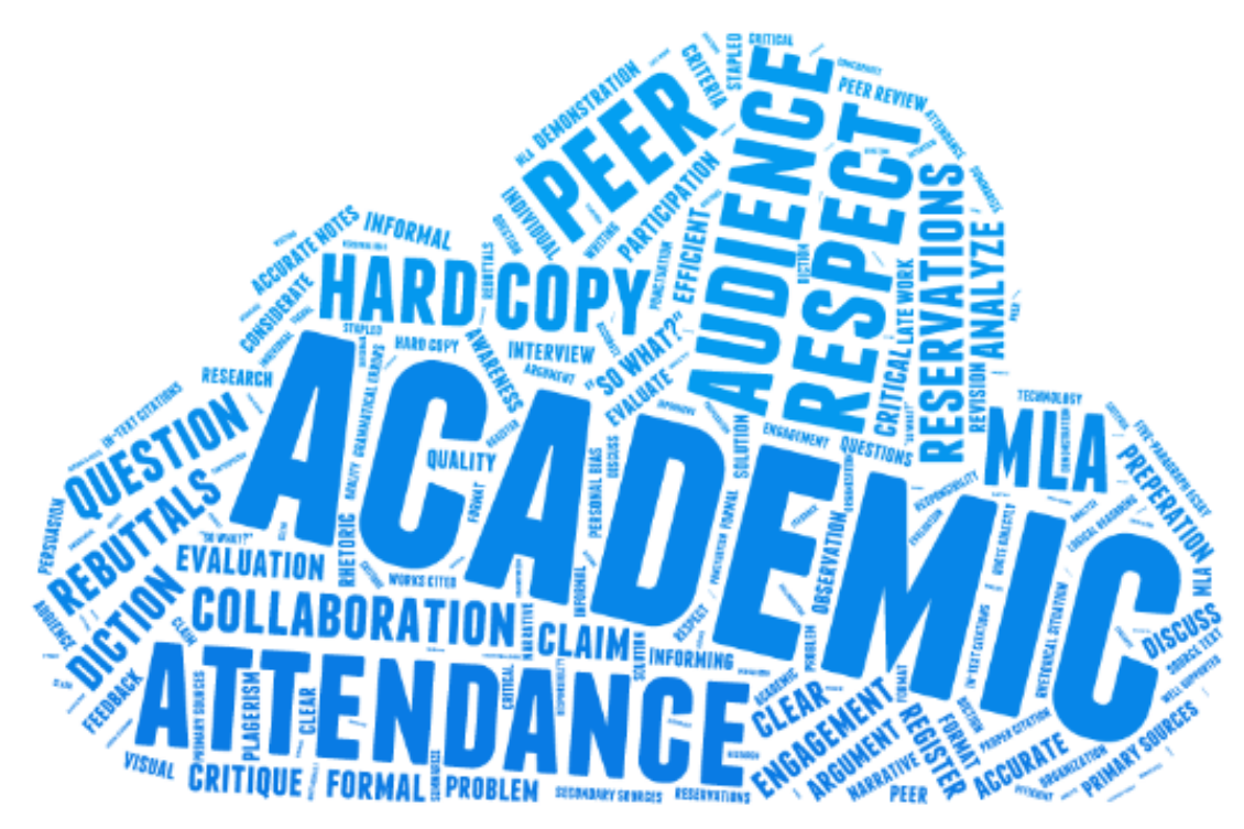
Figure 1: Word Map made by TA to represent their mentor's values.

Figure 1 shows a word map created by one of the TAs. Although the word map has the values that appeared more frequently in larger font, it does not meaningfully group the information. For example, it is unclear what academic refers to. While attendance is clearly student behavior and hard-copy means how papers are collected, these refer to different types of values.